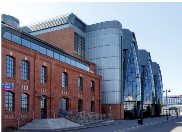
ECI Łódź — City of Culture, a former power plant