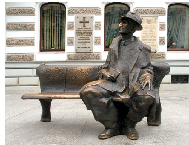
Julian Tuwim's Bench

Successful authors will be invited to submit a full paper of 6 A4 pages maximum by 30 June 2021.